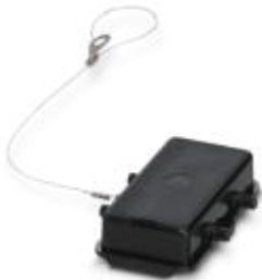
HEAVYCON protective cover, B10, for HC-EVO-B10... supporting base element, for double locking latch, with retaining cord with combination eyelet, IP54

Please be informed that the data shown in this PDF Document is generated from our Online Catalog. Please find the complete data in the user's documentation. Our General Terms of Use for Downloads are valid ( http://phoenixcontact.com/download )