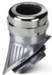
EVO metal cable gland with bayonet locking, B series, size M40, cable diameter: 19 - 27 mm

Please be informed that the data shown in this PDF Document is generated from our Online Catalog. Please find the complete data in the user's documentation. Our General Terms of Use for Downloads are valid ( http://phoenixcontact.com/download )