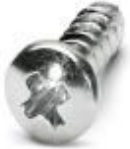
Screw set for DFK-PC 16... connectors