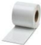
Marker strip, Roll, white, unlabeled, can be labeled with: THERMOMARK ROLL 2.0, THERMOMARK ROLL, THERMOMARK ROLL X1, THERMOMARK ROLLMASTER 300/600, THERMOMARK X1.2, mounting type: adhesive, for terminal block width: 90000 mm, lettering field size: continuous x 3.8 mm, Number of individual labels: 210000