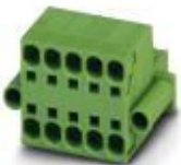
PCB connector, nominal current: 41 A, rated voltage (III/2): 1000 V, nominal cross section: 6 mm 2 , number of positions: 2, pitch: 7.62 mm, connection method: Push-in spring connection, color: green, contact surface: Tin

Printed-circuit board connector - TSPC 5/ 2-STF-7,62 - 1728206