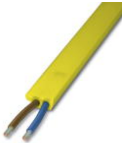
AS-Interface PUR flat conductor in yellow, 2 x 1.5 mm², 100 m ring

Please be informed that the data shown in this PDF Document is generated from our Online Catalog. Please find the complete data in the user's documentation. Our General Terms of Use for Downloads are valid ( http://phoenixcontact.com/download )