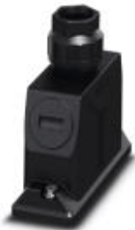
HEAVYCON ADVANCE B24 sleeve housing, with screw locking (Allen screw), plastic, height: 100 mm, with 1 x M32 thread, straight cable outlet

Please be informed that the data shown in this PDF Document is generated from our Online Catalog. Please find the complete data in the user's documentation. Our General Terms of Use for Downloads are valid ( http://download.phoenixcontact.com )