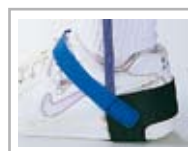
Polyester+ conductive fiber

These versatile heel grounders have a specially designed dual-layered cup construction for superior floor contact.