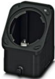
HEAVYCON EVO sleeve housing, plastic, with bayonet flange for EVO screw connection, B6, for single locking latch, height: 60.5 mm, without EVO screw connection

Please be informed that the data shown in this PDF Document is generated from our Online Catalog. Please find the complete data in the user's documentation. Our General Terms of Use for Downloads are valid ( http://download.phoenixcontact.com )