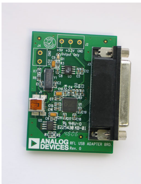
Figure 1. EVAL-ADF4XXXZ-USB Adapter Board

This board is designed to allow currently available evaluation boards that were designed for programming by a PC parallel port to be programmed via the PC USB port. The adapter connects to the PC USB port and the evaluation board's 25-way parallel port connector. For information regarding the evaluation board and operation of software, consult the relevant evaluation board documentation.