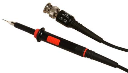
Model 6495 Modular Passive Oscilloscope Probe