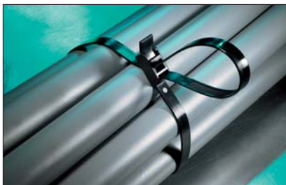
SpeedyTie - Quick and easy.