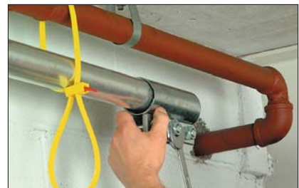
SpeedyTie is particularly suited for temporary but safe bundling or fixing.