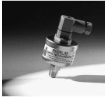
SA with Hirschmann connector