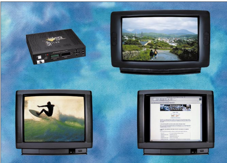
The L64733/34 supports a wide range of worldwide DBS applications.

The L64733/34 chip set, a component of the Integra set-top box platform, is a next-generation tuner and channel receiver that provides a highly integrated, high-performance solution for digital satellite broadcast TV. The chip set provides essential tuning and demodulation functions for the set-top platform, enabling a spectrum of applications, ranging from receive-only digital video broadcast to high-speed Internet access, IP telephony, Video-on-Demand and wireless communications. It enables manufacturers to compete in the marketplace by cost-effectively leveraging new digital forms of information and entertainment in the set-top box platform