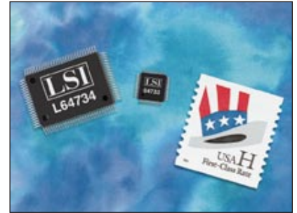
LSI Logic's Two-Chip QPSK Tuner/Demodulator

Combining LSI Logic's market-proven channel technology with an advanced tuner IC in a small, compact design, the chip forms a complete 'L band to bits' system, eliminating the need for tuner cans or additional synthesizer chips. As a result, the two-chip solution can be implemented directly on the motherboard or on a module smaller than the size of a credit card. Manufacturers can develop cost-effective solutions for add-on PC cards or multiple digital TV front-ends.