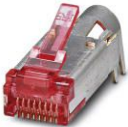
RJ45 male insert, CAT6, 8-pos., shielded, IDC pierce connection, for AWG 27 litz wires ... 24, with strain relief

Please be informed that the data shown in this PDF Document is generated from our Online Catalog. Please find the complete data in the user's documentation. Our General Terms of Use for Downloads are valid ( http://phoenixcontact.com/download )