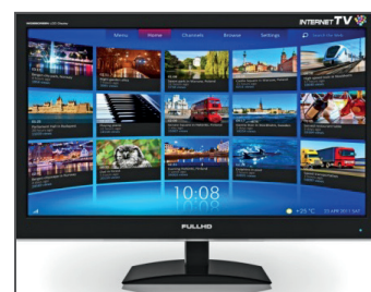
Wireless Internet TV