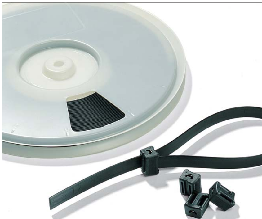
The EL-Ty can be cut to suit any bundle.

These robust cable ties are particularly suitable for use with larger diameter cables, pipes and hoses. Designed originally for securing overhead, catenary, cables (when used with the spacers) they are now used in many industries from the building sector, through to the chemical industry, to the installation of signs for traffic management.