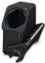
HEAVYCON EVO coupling housing, plastic, with bayonet flange for EVO screw connection, B16, with single locking latch, height: 81 mm, without EVO screw connection

Please be informed that the data shown in this PDF Document is generated from our Online Catalog. Please find the complete data in the user's documentation. Our General Terms of Use for Downloads are valid ( http://download.phoenixcontact.com )