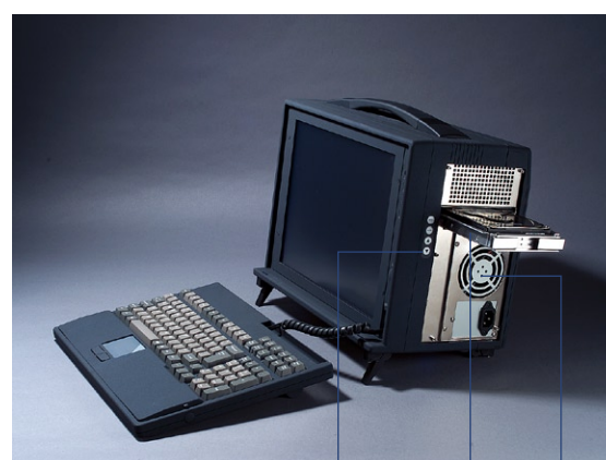
Monitor adjustment Supports 3.5" HDD ATX power supply