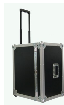
Air cargo bag