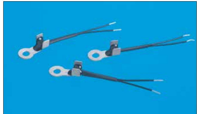
MS RT24 Surface Temperature Sensor

Contact the factory for specific design or application information or the availability of options.