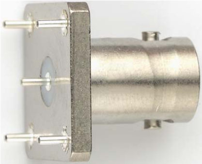
Model 7073 BNC (F) Straight PCB Mount 50 \Omega

Use for secure attachment in 50 Ω PCB mount applications.