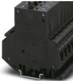
Thermomagnetic circuit breaker, 3-pos., normal blow, 1 N/O contact and 2 N/C contact, with universal foot for mounting on NS 32 or NS 35

Please be informed that the data shown in this PDF Document is generated from our Online Catalog. Please find the complete data in the user's documentation. Our General Terms of Use for Downloads are valid ( http://download.phoenixcontact.com )