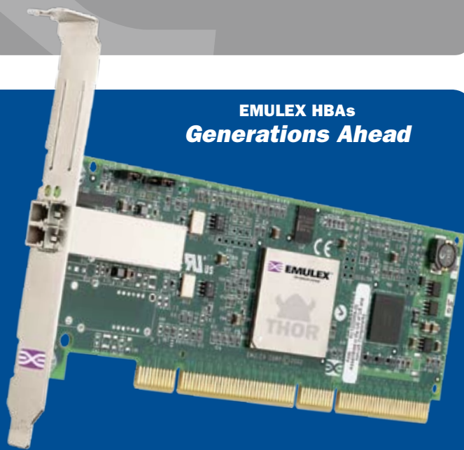
EMULEX HBAs Generations Ahead