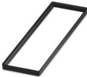
Replacement seal for size 2 sleeve

Please be informed that the data shown in this PDF Document is generated from our Online Catalog. Please find the complete data in the user's documentation. Our General Terms of Use for Downloads are valid ( http://phoenixcontact.com/download )