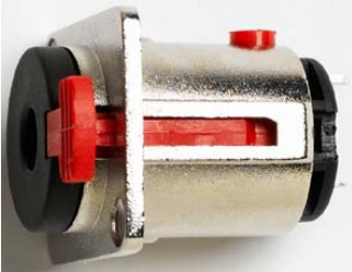
Model 6877 1/4" Receptacle, Panel Mount, Locking