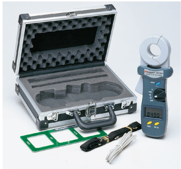
DET10C and 20C comes with a rugged carry case, calibration fixture, carry case shoulder strap and USB interface cable (DET20C only).