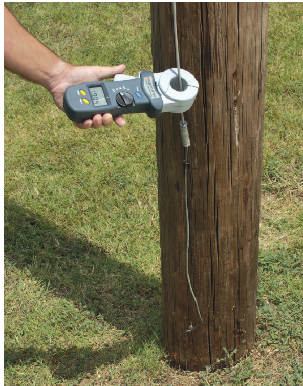
The DET20C instrument is shown being used to test a pole ground.

3 Auto range, 50/60Hz, true RMS to crest factor <3.5