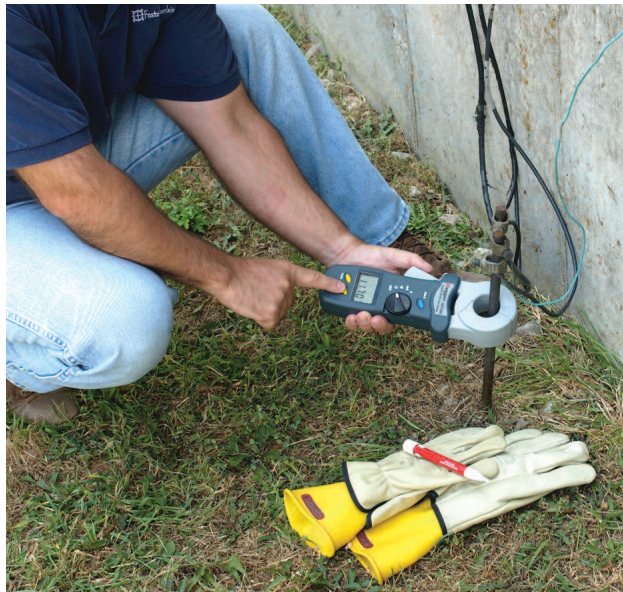
The DET20C instrument is shown being used to test a facility ground.