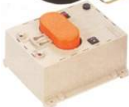
C-251 charger for use with H-251 MK1

The C-251 battery charger is for use with the Wolflite H-251 Mk1, which requires the battery pack to be removed to recharge. The battery is simply slotted into the C-251 and secured in place with the latch plate.