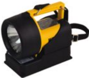
C-251 HV/LV charger for use with H-251E or H-251 MK2

C-251 HV/LV chargers are for use with the Wolflite 251 Mk2 and Euro-Wolflite Handlamps. Batteries are charged internally in these products via charging studs on the base of the handlamp. The chargers are designed to hold the handlamps while charging enabling the handlamps to always be ready for use. The C-251 HV is for use at mains voltages of 230 volts or 120 volts, selectable by voltage changeover switch. The alternative version, the C-251 LV is for use in vehicles at low voltages of between 12 and 32 volts.