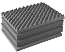
1601 4 pc. Replacement Foam Set