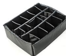
1605 Padded Divider Set