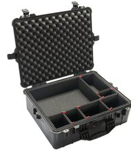
1600TP With TrekPak Divider System