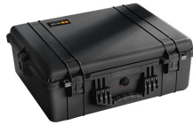
1600NF No Foam