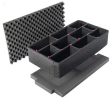
1600TPKIT TrekPak Case Divider Kit