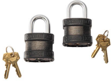
PL2 Padlock (2 pack)