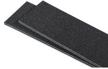
1510TPDIV Extra TrekPak Dividers