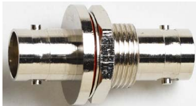
6744 BNC (F/F) Panel Mount Hermetically Sealed-75 \Omega